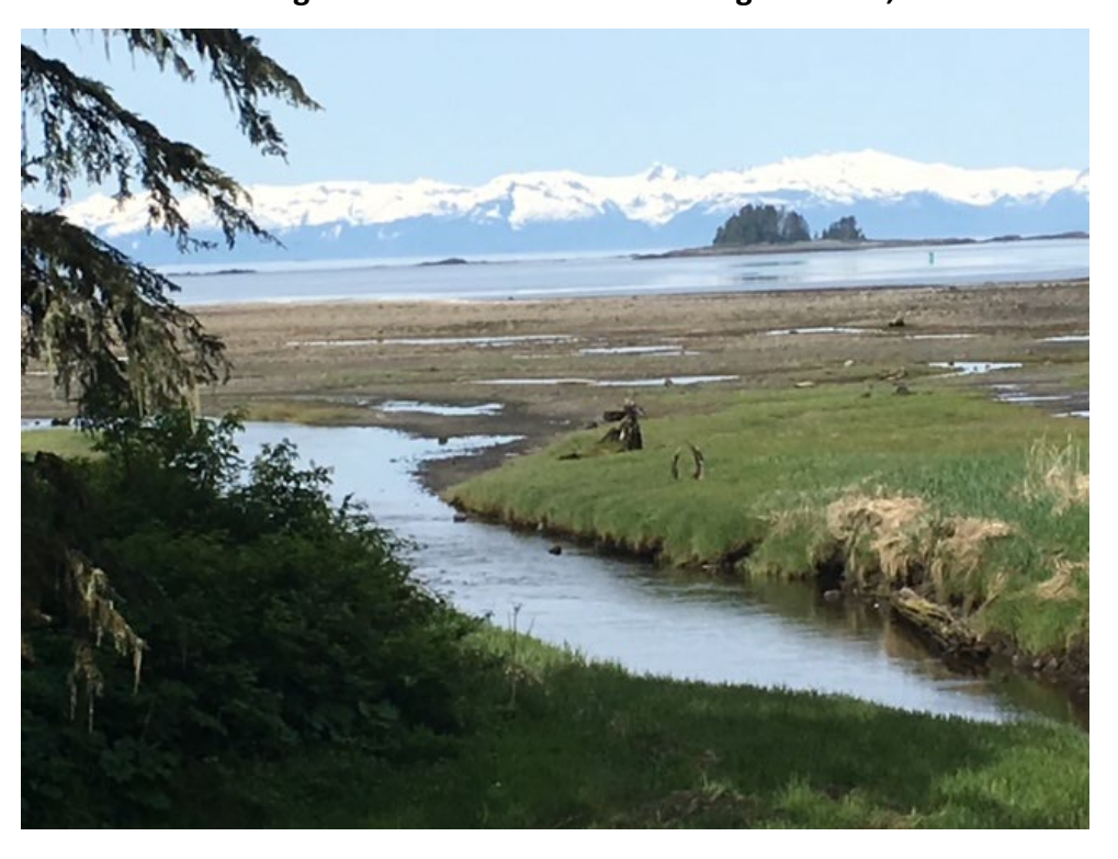
Figure 2: Aerial View of the Village of Kake, AK